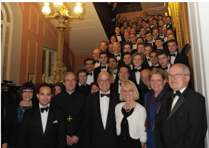
Photograph: St Benet's Hall Gaudy 2013

The St Benet's Hall Gaudy will take place this year on Friday 6 November at the Carlton Club , 69 St James's Street, London SW1A 1PJ. We are delighted to announce that our special guest speaker will be the Chancellor of the University of Oxford, Lord Patten of Barnes.