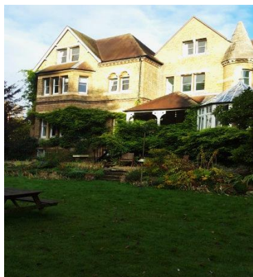
The garden of 11 Norham Gardens

Norham Gardens | Since 1922 St Benet's Hall has been located in a single building at 38 St Giles (formerly at Woodstock Road and later, Beaumont Street), but from October 2015 St Benet's expanded to a second building at 11 Norham Gardens. This building contains student accommodation and other facilities, a library area, teaching rooms and offices, as well as a flat for the Master and his family. It also has workspace for the graduate students.