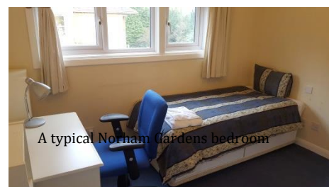
A typical Norham Gardens bedroom